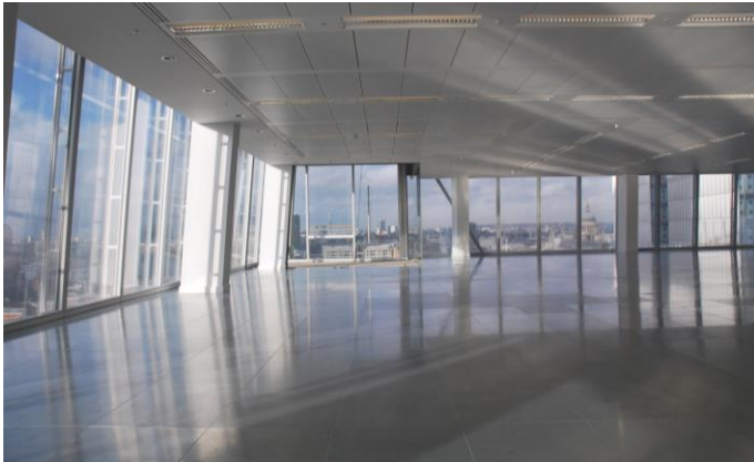
Photos are for indicative purposes prior to fit out